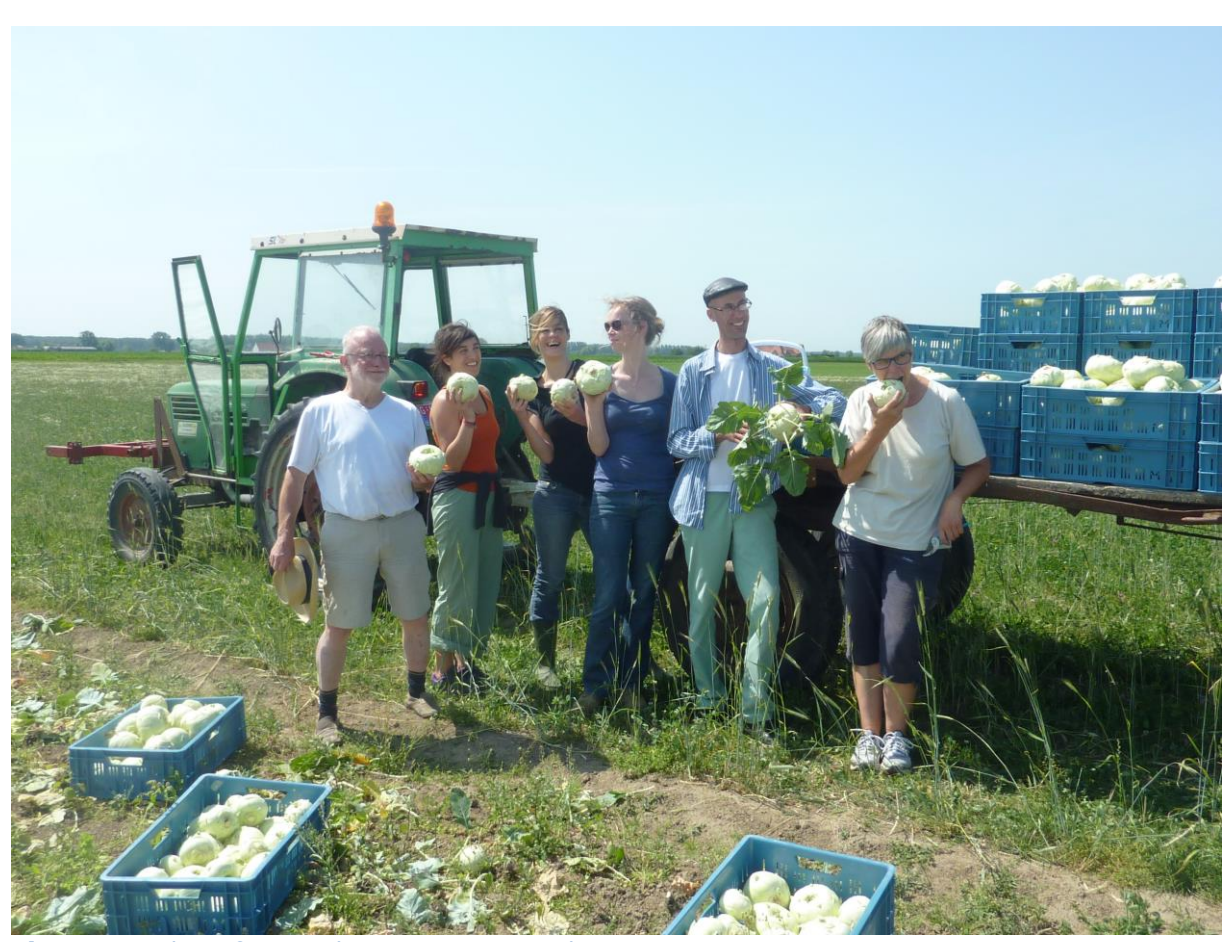
Figure 1 A photo from a gleaning event in Belgium.

In repeated discussions with the stakeholders, the key criteria identified for any dissemination tool were: user-friendliness and ease of access (for example, having a bespoke website requiring a new user account & password, was not favoured); visual appeal; relevance to audience. It was strongly felt that the dissemination tool should not be "hidden away" within an "academic" resource.