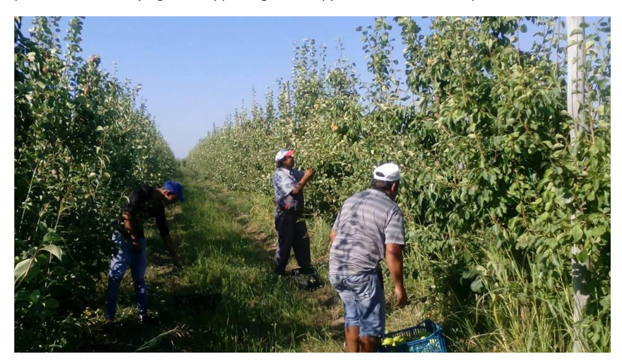
Figure 2 A photo from a gleaning event in Greece.

Generally, each RGP faced little difficulty in finding organisations who wished to receive and use gleaned produce. In some instances, however, the maximum quantity of food available for gleaning exceeded the capacity of the recipient organisations: in which case the RGP has no choice but to leave a portion of the available crop unharvested, as to recover the crop would only create a waste problem further downstream. There are a number of potential solutions to this. One is cross-border collaboration between EU countries: for example, Gleaning Network Belgium has already begun collaborating with a recipient organisation based in the Netherlands. Another is the fostering of more Social Enterprises who can utilise larger quantities of produce via processing, such as Kromkommer (also in the Netherlands). The Food Surplus Entrepreneurs Network may be pivotable in identifying and supporting these opportunities for development.