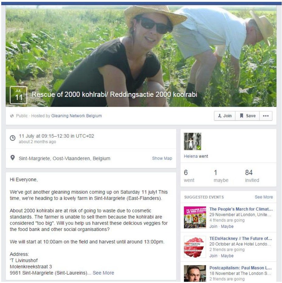
Figure 3 A screenshot of a social media page of the Gleaning partner in Belgium, showing how they advertise a gleaning event.

Below is a Facebook post from Gleaning Network Belgium (July 2015) advertising a forthcoming gleaning day and calling for volunteers: